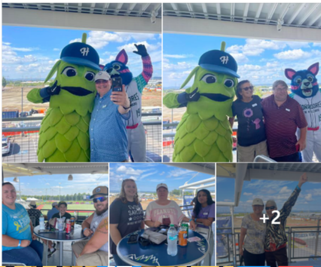
Enjoying the HOPS game with the Portland area #Sarcoma community. #dragonslayersunite