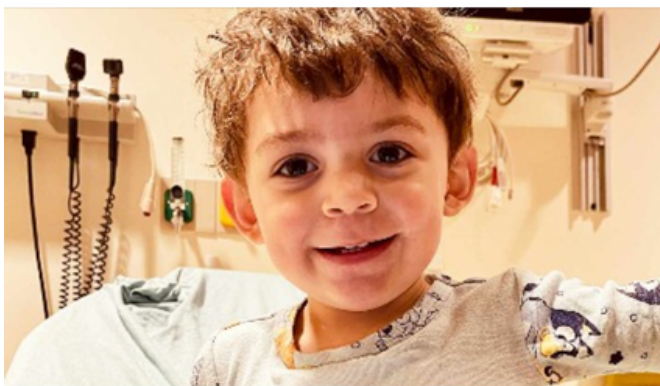
Mom Warns Parents After She Says Son's Symptom for Pediatric Sarcoma Was Dismissed: 'Trust Your Intuition' (Exclusive)